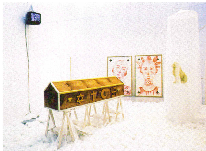
Barthelemy Togu, Life Trial , 2006, mixed-media installation, dimensions variable.

Art Statements Gallery is located at 5 Mee Lun Street (down from 85 Hollywood Road), Central. Tel/Fax: (852) 2122 9657. www.artstatements.com . Δ